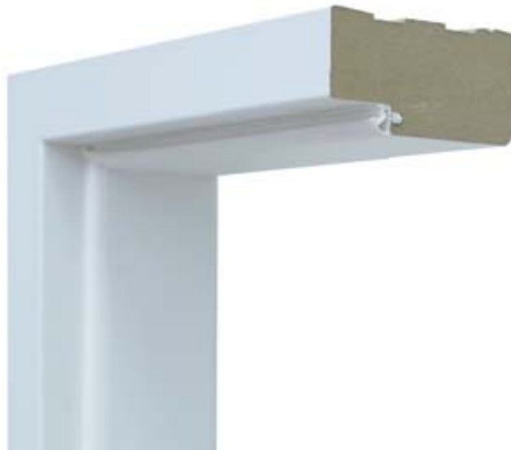
fixed door frame